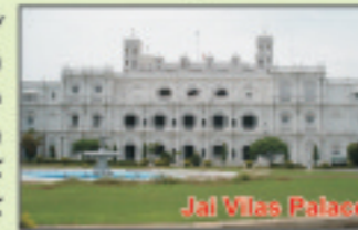
Jai Vilas Palace

Gwalior's history was revealed as a legend in 8th century AD when a chief tain known as Suraj Sen was