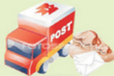
POST OFFICE JUST HALF A KM.