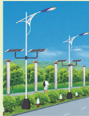
ROADSIDE PLANTATION ON 7 FEET WIDE FOOTPATHS.