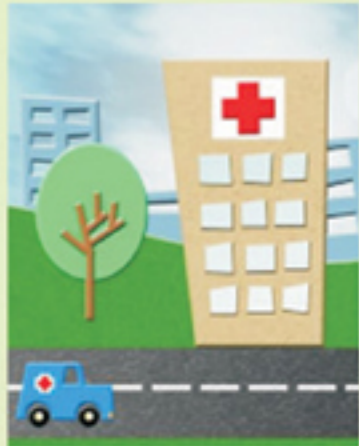
MEDICAL FACILITIES SUCH AS BIRLA INSTITUTES IS JUST 2 KM AWAY AND MEDICAL COLLEGE IS COMING JUST HALF A KM AT THE BACK OF JANAKPURI.