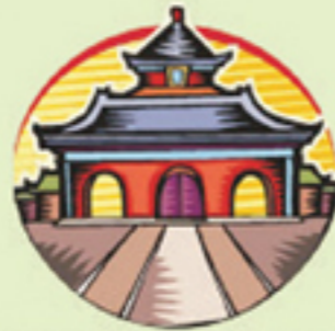
FAMOUS TEMPLES SUCH AS SHIVA TEMPLE, RAM JANKI TEMPLE & SURYA TEMPLE ARE IN CLOSE VICINITY.