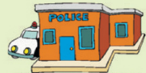
POLICE STATION & POLICE CHOWKI IS JUST HALF A KM.