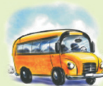
STREET TRANSPORT IS AVAILABLE ROUND THE CLOCK.