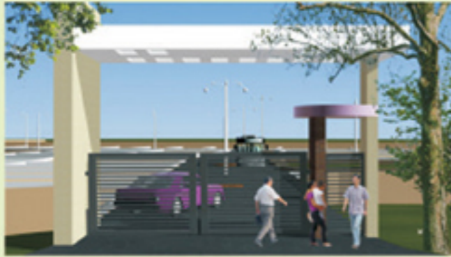
MAIN GATE - ENTRY THROUGH STYLISH GATE.