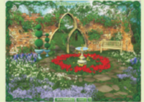
TWO GARDENS, EACH 10000 SQ.FT. (APPROX.) AREA WITH FLOWERING PLANTS AND LAWNS WILL PROVIDE COOL & HYGIENE ENVIRONMENT.