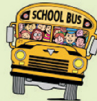
THE JANAKPURI IS SURROUNDED BY ACADEMICS INSTITUTIONS & SCHOOLS SUCH AS PRESTIGE COLLEGE, GWALIOR ENGINEERING COLLEGE, AMITY UNIVERSITY, MEDICAL COLLEGE & HOTEL MANAGEMENT COLLEGE.